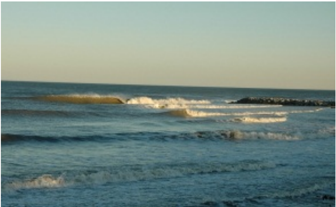
Figure 2- Waves at Herring Point Groin – Surf Break Created by Groin Effects