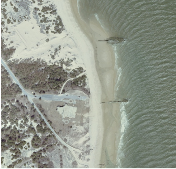
Figure 1- Aerial Photograph of Herring Point – note beach offset from south to north sides