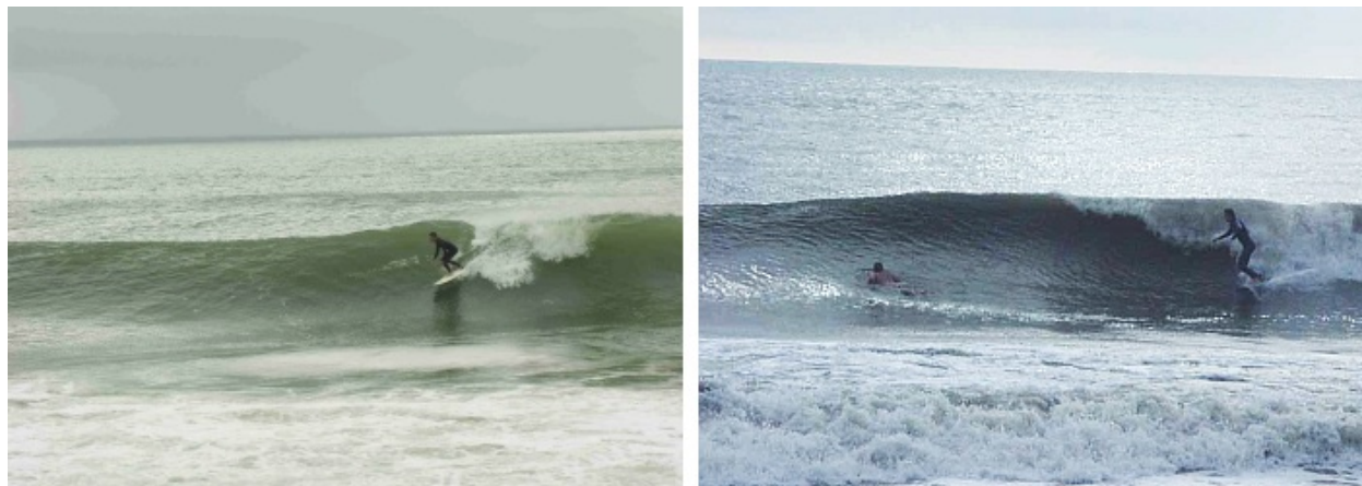
Figure 5 - Surfable waves in Bethany Beach (left) and Rehoboth Beach (right) in 2003 prior to federal beach fill projects

majority of Delaware surfers either endured infuriating and dangerous crowded conditions at Cape Henlopen Herring Point or drove an extra hour south to surf Ocean City or Assateague in Maryland.