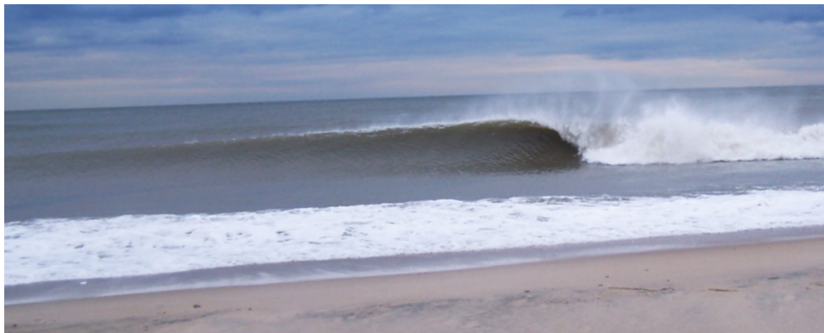
Figure 6 - Surf break at Gordon's Pond State Beach in 2003. Stone groins here produced good surf until buried in sand flowing out of the federal beach fill project in Rehoboth Beach, an unintended project side effect on the State Park Beach

The Delaware SRF Chapter advocates surfing conditions to be considered in the planning, management and project design, and believes this will only be possible if improved communication can exist between the surfing community and the DE DNREC and ACOE.